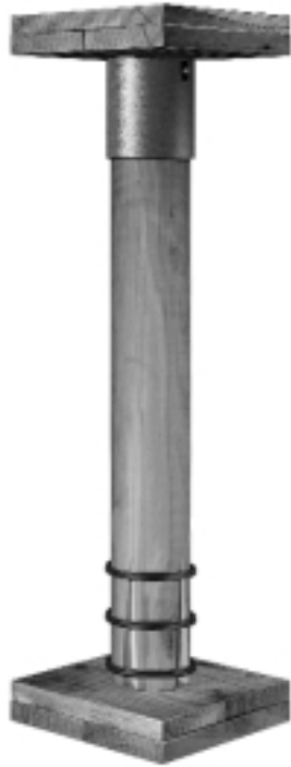
POWER WEDGE with PROPSETTER®