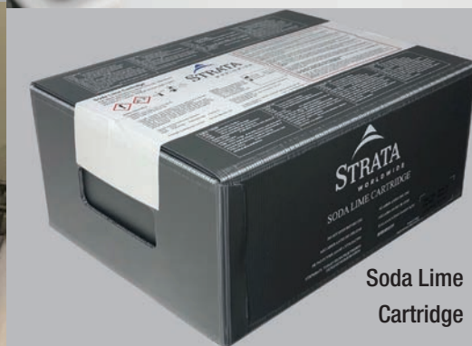
Soda Lime Cartridge