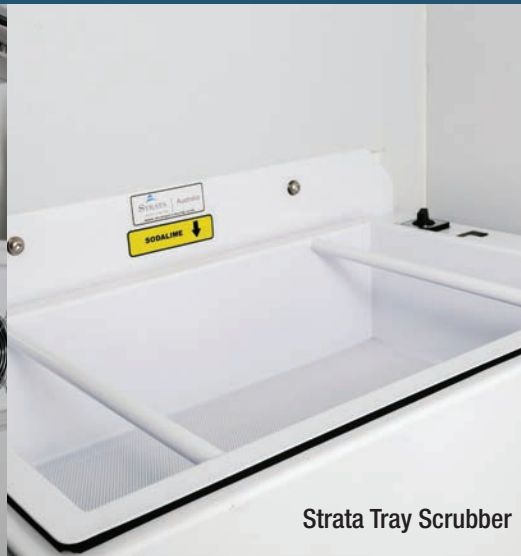
Strata Tray Scrubber