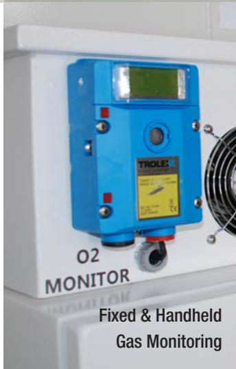
Fixed & Handheld Gas Monitoring