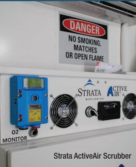
Strata ActiveAir Scrubber