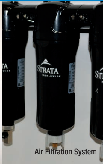
Air Filtration System