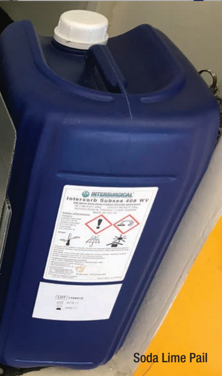
Soda Lime Pail