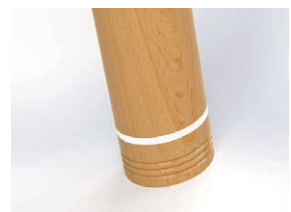
Yield Indicating Band