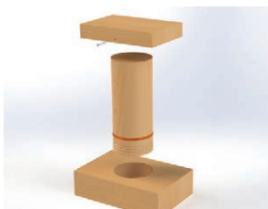
Adams Prop GA