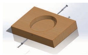
Secure Cap Headboard