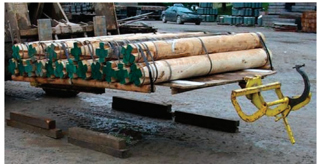
Cluster Prop Performance