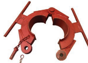
Cone Setting Tool