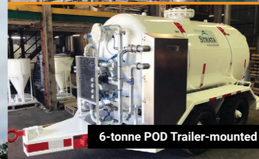
6-tonne POD Trailer-mounted