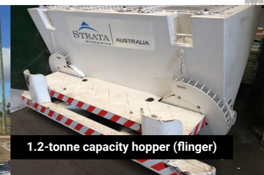
1.2-tonne capacity hopper (flinger)