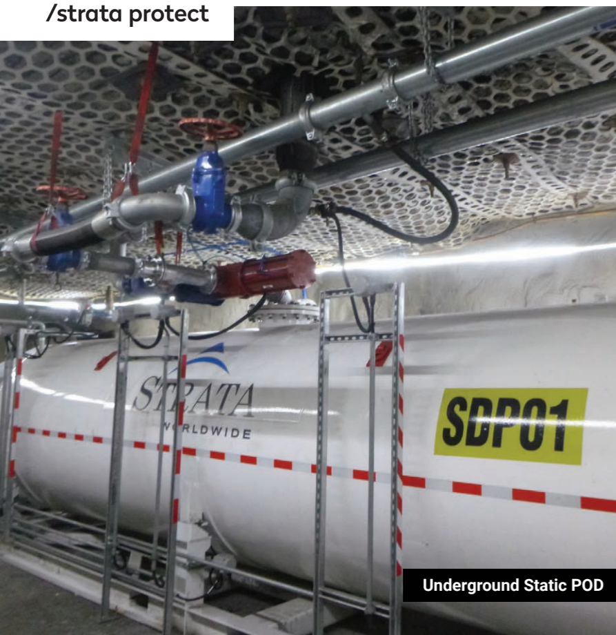
Underground Static POD