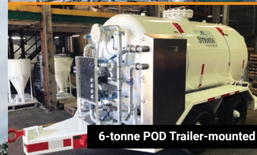
6-tonne POD Trailer-mounted