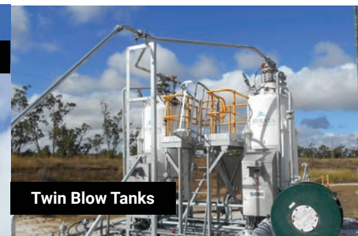
Twin Blow Tanks