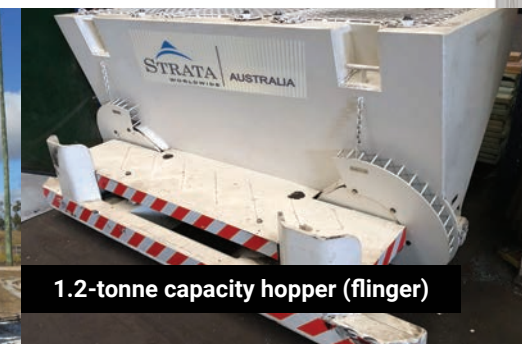
1.2-tonne capacity hopper (flinger)