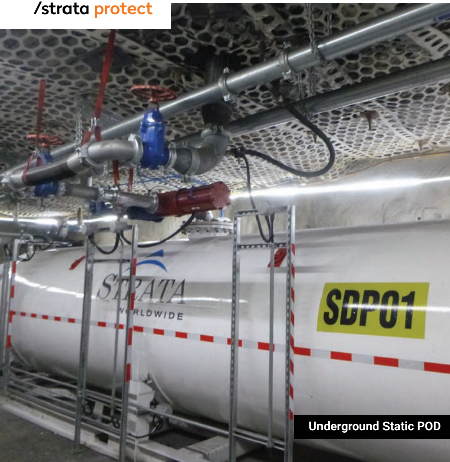
Underground Static POD